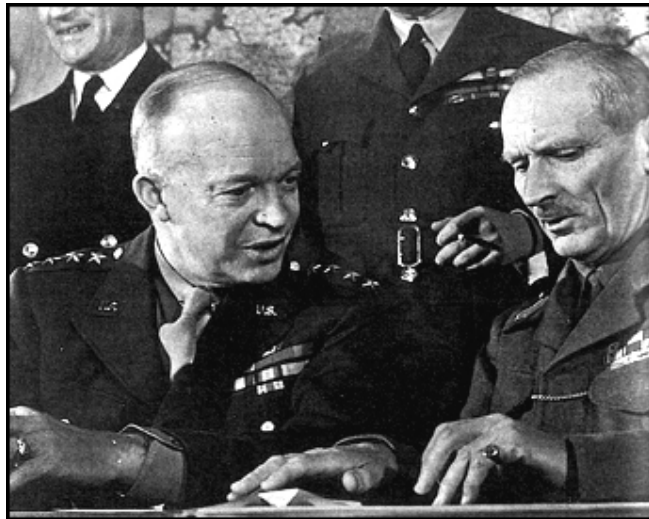
Generals Eisenhower and Montgomery - D-Day 1944

The task of creating the tremendous war coalition of allies for the purpose of invading Nazi-occupied Europe was a matter requiring the cooperation of many governments. But the task of managing the combat operations of that coalition was up to a single individual, General Dwight D. Eisenhower. Ike went to great lengths to hold the coalition together. He worked hard to maintain cordial relations with his subordinate commanders as he exercised his duties as Supreme Commander. But Field Marshal Sir Bernard Law Montgomery of Great Britain created a series of contentious incidents that finally developed into a direct command collision with Ike near the end of the war. The situation came very close to ripping the alliance asunder.